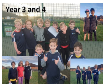
Year 3 and 4

Also a massive congratulations to these following pupils that performed at a superb standard and qualified for the Harborough District Final Cross-Country Championships 2022: