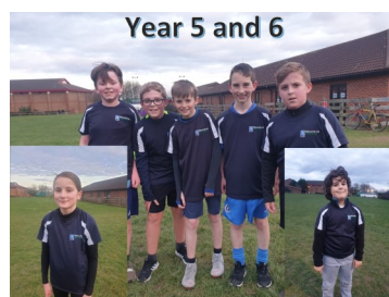
Year 5 and 6