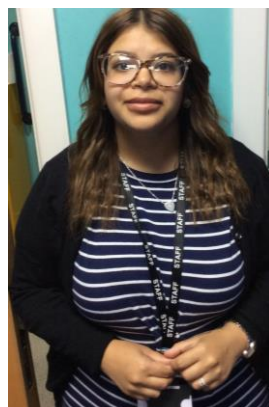
Miss Dasantos 1:1 support