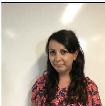
Miss Youngs 1:1 support